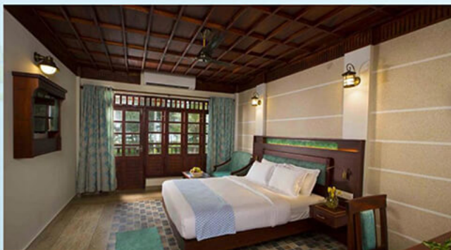
Beach View Room

The accommodations at the Indriya Adventure Park consist of elegantly furnished rooms set on two floors of a block adjacent to the restaurant. The rooms on both floors look out at the adventure Park and the rooms with balconies on the first floor, the beach and the ocean beyond. The rooms are all luxurious without being ostentatious - wooden roofs, stylishly elegant fabrics and state of the art in amenities.