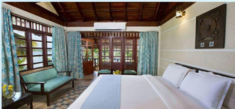
Backwater View Room